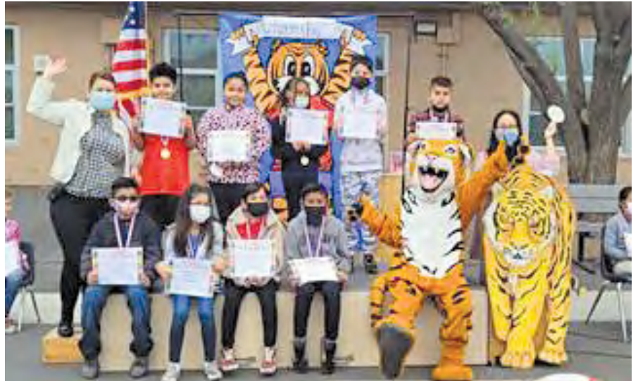
March Student of Month Assembly

In March we focused on lessons that highlight all the ways that students can make a difference by helping their class and school community. We even had a special visit from our beloved mascot TIGER!