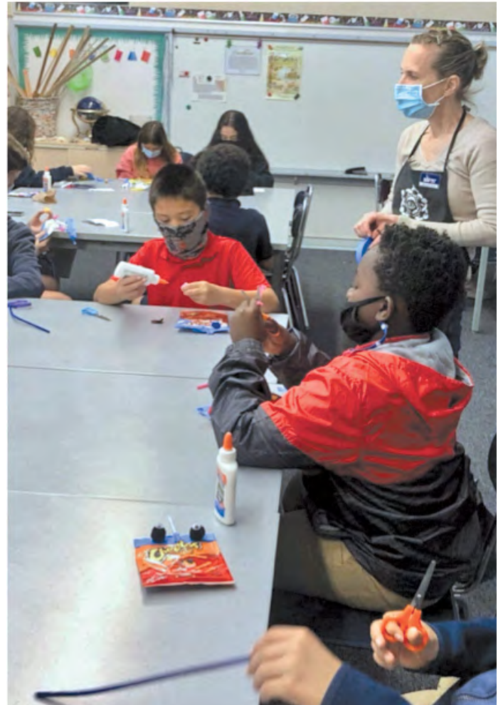
Students in the Science Lab discovering pneumatics with recycled chip bags and straws

Students at Emerson have had lots of hands-on learning with STEAM this year! Twice a month, all students visit the Emerson Science Lab for discovery lessons with Shared Science, our community partner. Our 4th & 5th grade Robotics Club meets monthly to learn coding and our Robotics Team has been preparing to participate in the Elementary Robotics Showcase at