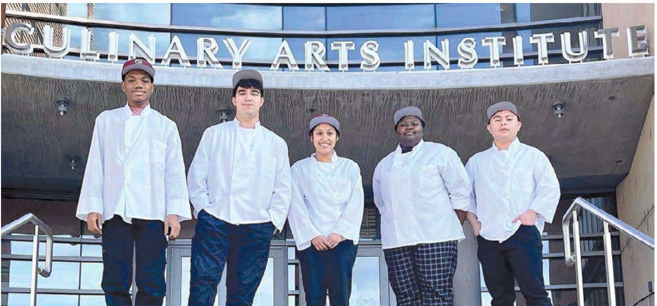
Browning chefs attend the C-CAP competition.

The 5 students in the finals will be preparing Chicken Chasseur with tournéed potatoes, and crepes patisserie. They are currently perfecting their knife cuts, recipes, presentation, and plating for the final competition. Good luck to the Browning chefs!!!