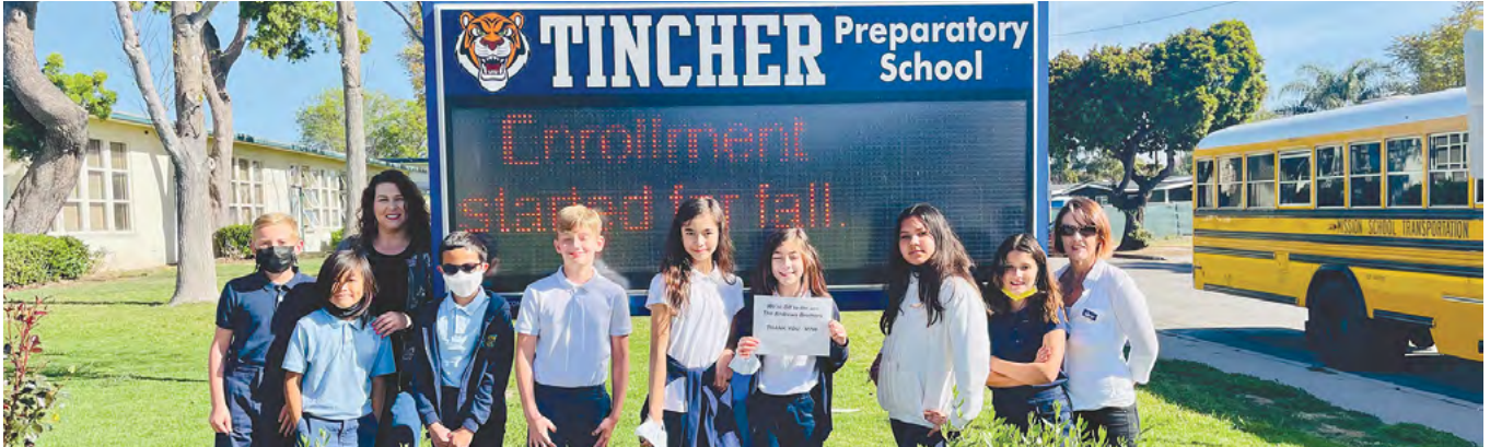
Tincher Tigers and parent chaperones prepare for their first field trip in 2 years

plot, listened to the music of the era, and wrote letters for Operation Gratitude, an organization that supports military veterans and their caregivers. It was a beautiful day and you could feel the excitement as students walked to the Carpenter Center. The performance was top-notch and students left with smiles on their faces. What a wonderful way to remind students of the power of the performing arts.