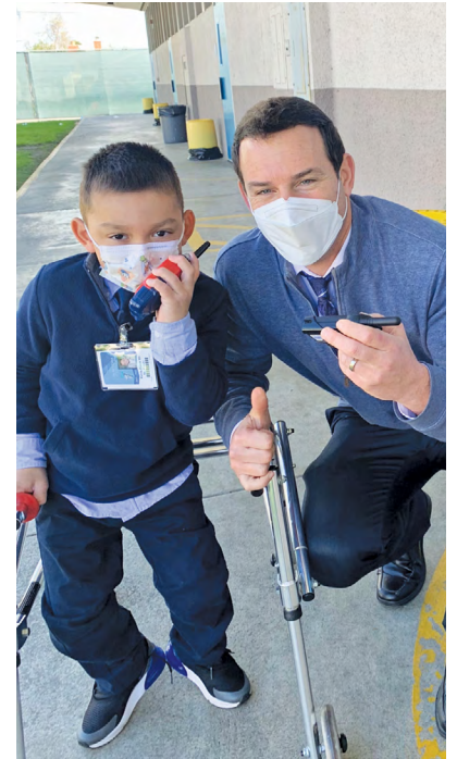
Students dress alike as part of "Twos" day Twin Day on Tuesday, 2/22/22.