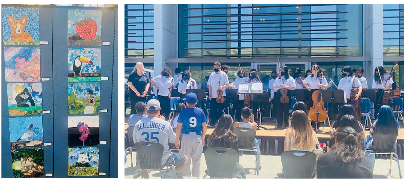
Student Musicians, Dancers, and Artists represent PVMS at the Take Part Art Festival.

We are very proud of our student and staff contributions to the festival. As we close out or school year, we want to wish all our families and staff a relaxing, joyful summer!