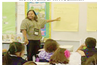
School Counselor presents a guidance lesson on friendship.

As 2015 approaches, we are moving full steam ahead with our PBIS Assemblies, rewarding students for good character and decision making skills. Students with good character will have lunch with the counselor and play board games on the cafeteria stage. We are providing guidance lessons for all students K-5 using the PATHS Curriculum: Promoting Alternative Thinking Strategies. Lesson topics include: feelings, friendship, and conflict resolution.