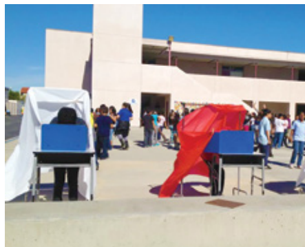
York Student Leadership elections.