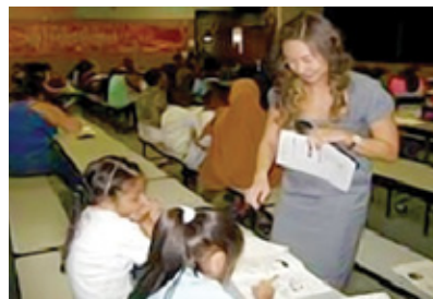
Literacy Coach assists students during the November HPA Seminar.