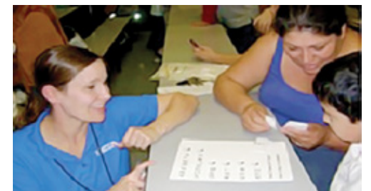
Kinder teacher, assists a parent and student with a phonemic awareness activity.

As 2015 approaches, we are moving full steam ahead with our PBIS Assemblies, rewarding students for good character and decision making skills. Students with good character will have lunch with the counselor and play board games on the cafeteria stage. We are providing guidance lessons for all students K-5 using the PATHS Curriculum: Promoting Alternative Thinking Strategies. Lesson topics include: feelings, friendship, and conflict resolution.