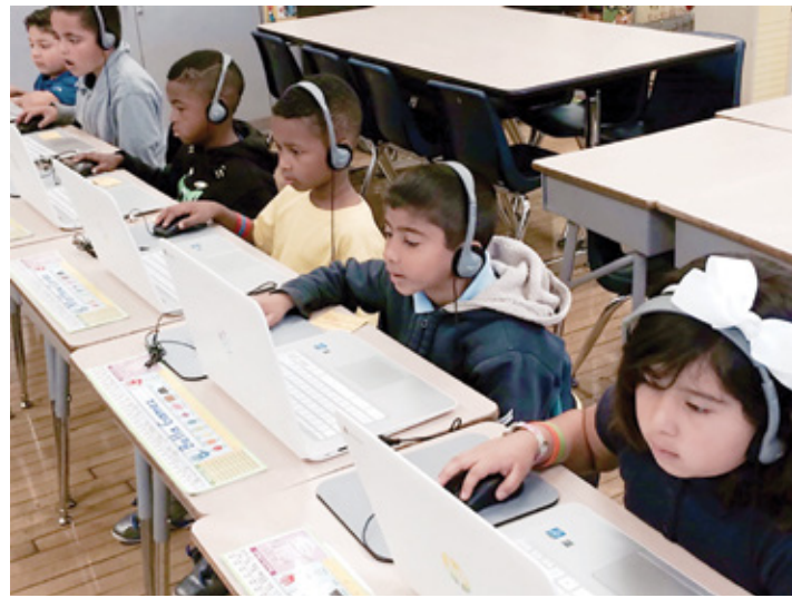
First grade Wildcats strengthening their computer skills in class.

Please encourage your child to practice at home by having them to put down the video game controller and pick up a computer keyboard and mouse and