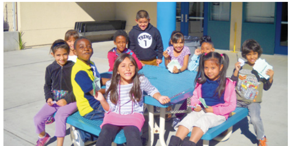
Jefferson students happily display their Positive Behavior vouchers.

This support system is very popular with our students, and we are already experiencing a more positive school climate. We want to thank those parents who are actively reinforcing this Positive Behavior Support System at home. Keep it up!