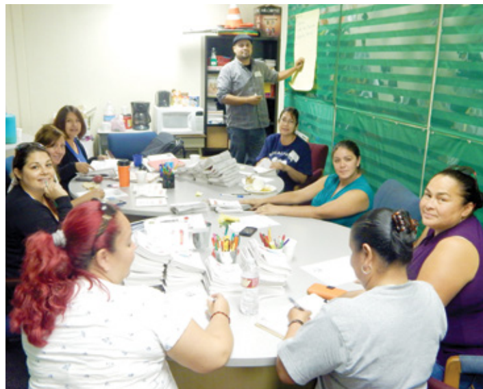
New Parent Center.

On any given day, you can find parent volunteers meeting, working on class projects, planning, researching on computers, or having lunch in the new PC. Teachers regularly send materials and projects for parents to work on, which not only helps the teachers and students but also allows parents to be part of their children's education.