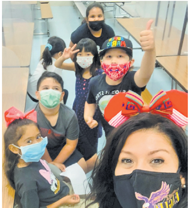
If you can dream it, you can do it. – Walt Disney ASB hosts Disney Day at Sanchez

My hopes for this school year is for all Eagles to reset and familiarize themselves with the at-home and in school routines, that will support and encourage their personal and academic leadership. Additionally, my vision includes continued, in depth participation from all members of our devoted team. Lastly but most important, I hope to develop a stronger partnership with our wonderful parents as they assist and support us in providing an academically rich and engaging experience for all our students.