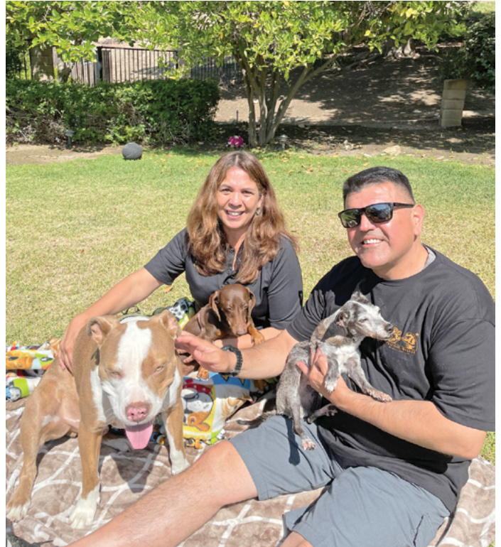
Relaxing with my husband and fur babies.