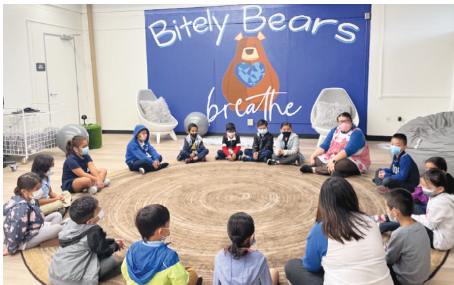
Bitely Bears Breathe: A Focus on Wellness

resources, behavioral health services, and positive youth activities in a location that is fun, safe, and convenient – right on Bitely's campus. Bitely's Wellness Center is a safe space that seeks to support the academic, emotional and social well-being of students and their families.