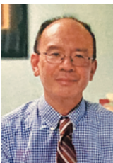
Hing Chow Principal

901 E. Graves Ave., Monterey Park, CA 91755 • 626/307-3300 mvista.garvey.k12.ca.us