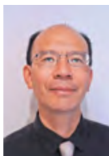
Hing Chow Principal

901 E. Graves Ave., Monterey Park, CA 91755 • 626/307-3300 • mvista.garvey.k12.ca.us