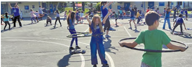
Hoop It Up Assembly