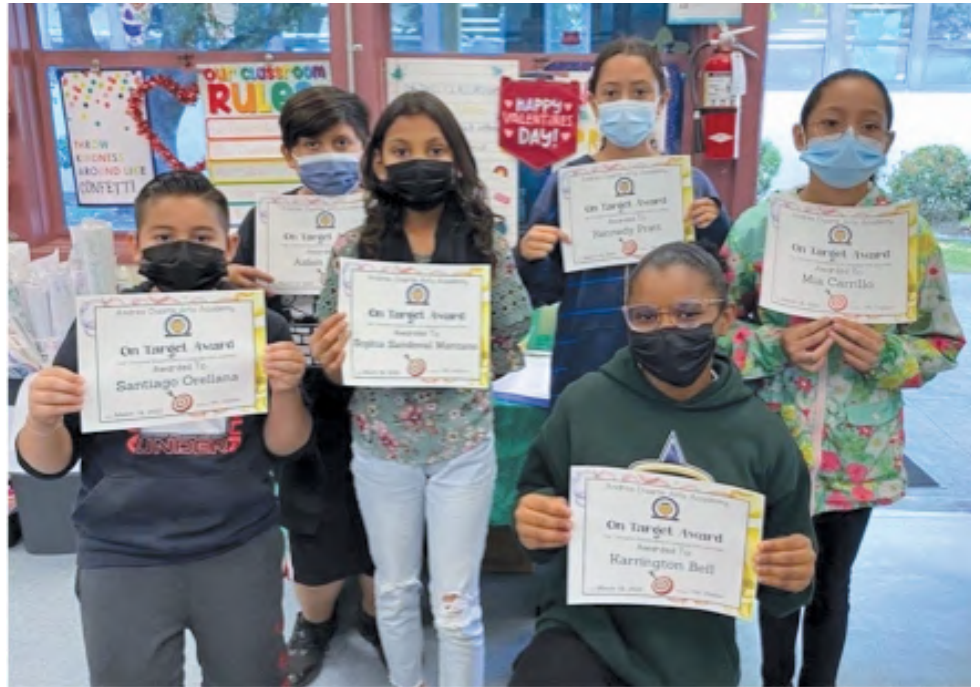
Andres Duarte Arts Academy student leaders in action.

for students to spend their ROAR dollars throughout the month. And our Volunteer Council has been leading the charge in maintaining our beautiful campus with campus beautification and campus clean up events. The staff and students of Andres Duarte have forever been impacted by the efforts and energy of our student leaders.