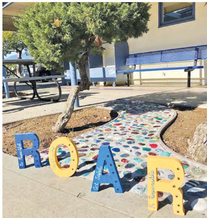
The future of the world is in our school and our students will be leading the way!

At Andres Duarte Arts Academy our students ROAR: Respect, Ownership, Act Safely, and take Responsibility.