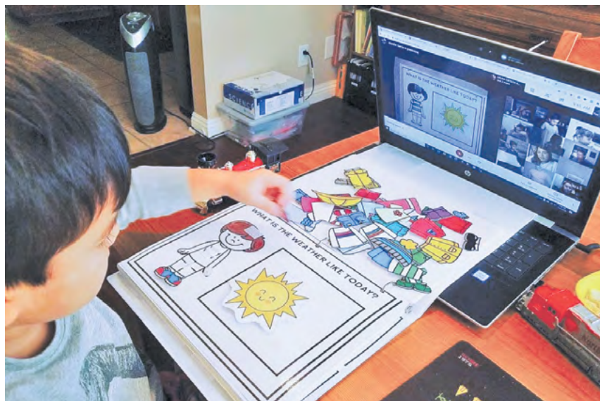
Example of the Multi-Tiered Systems of Support in action to help every student succeed.

If the student continue to struggle, support may include referral for academic testing, special accommodations, and high-intensity instruction through an individualized plan.