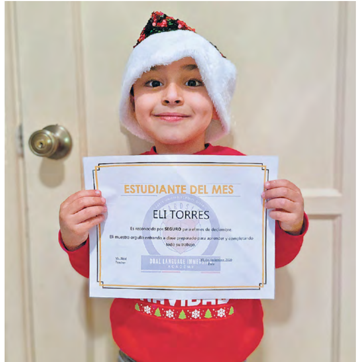
Congratulations to our student of the month awardees. We are very proud of their PAWS demonstration.

To support our students' social-emotional needs, weekly lunch bunches also occur. Students have an opportunity to meet with the principal, the teaching and learning coach, and their grade level teachers. We are not sure who enjoys this socializing more, the students with their peers or the teachers with the students. It is a great time had by all.