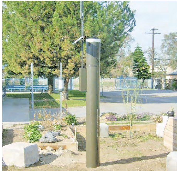
Students at M.I.T. High School have an appreciation for the metrics need to collect climate information by having an udometer on campus.

To keep up with the latest rainfall numbers in the area, go to https://dpw.lacounty.gov/wrd/rainfall/ and within the Rain Fall Interval (Inches) - Los Angeles County Public Works section, click on Mt. Olive High School.