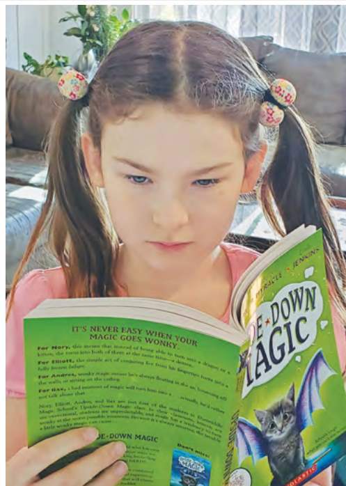
Students are excited to participate the many virtual literacy activities offered by our Library and Digital Media Center.

While we are remote, reading is bringing us together.