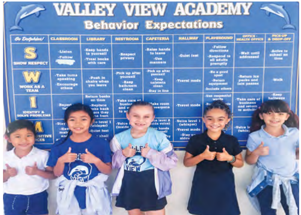
Our Dolphins are excited to include our SWIM expectations in our 2020 time capsule.

21, our school will reveal the time capsule last opened in January of 2000. Historically, every classroom researches and selects an object that represents the current time period. Our school and community are filled with excitement and anticipation as we plan to celebrate this milestone event. Our students are eager to see what has been buried for them to discover about the year 2000, and are diligently making decisions about what items to contribute that captures what life is like today for future generations to uncover twenty years from now. Special