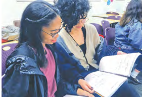
CSArts-SGV students study the score for their all-school musical, "In the Heights."

A much-anticipated event, the main-stage production was a massive cross-conservatory collaboration for both students and staff. "In the Heights" featured a cast of 9th-12th graders from the Acting, Musical Theatre, Vocal Arts, Creative Writing and Integrated Arts conservatories with choreography from the School of