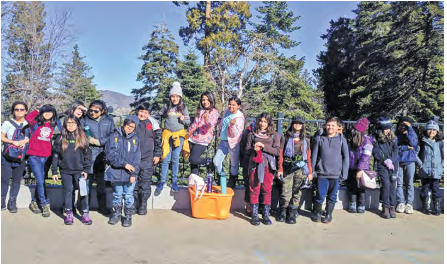
Fifth Grade students studying about California's mountain ecosystem at Pali Institute's Science Camp this winter.

Thanks to the collaboration of families, school and our district working together, not just Beardslee students, but all Fifth Grade students in Duarte Unified are given this amazing opportunity to participate in outdoor science school.