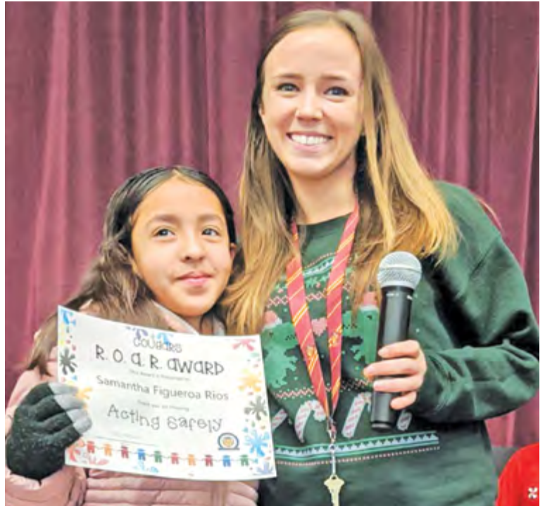
Recognition of student conduct is a central focus that is celebrated at Andres Duarte Arts Academy.

Students at Andres Duarte are really committed to making a positive change and supporting our school in so many different ways, and it is wonderful to celebrate their success and achievements.