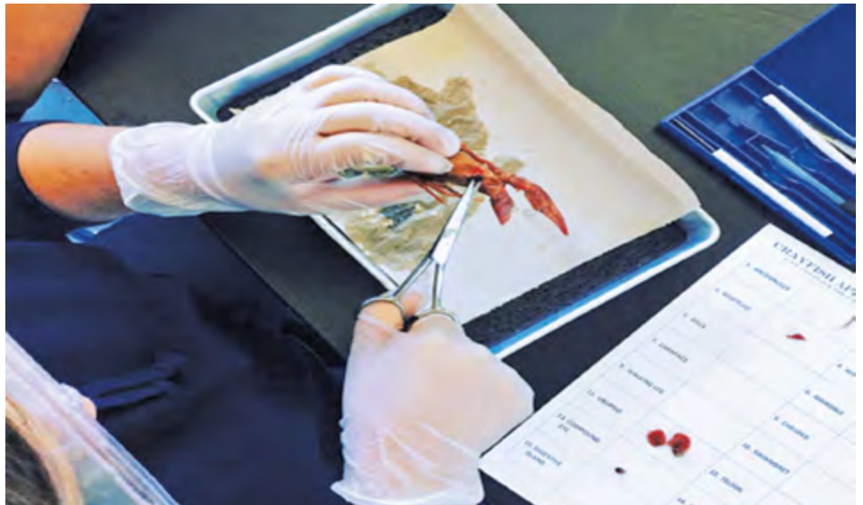
Royal Oaks students experimenting in our Science Lab.

applications. The lab currently consists of 40 microscopes, triple beam balance scales, graduated cylinders, flasks, and other specialized equipment. For volunteering opportunities or to donate materials to our Science Lab, please contact dhata@duarteusd.org.