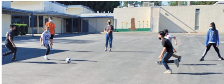
Andres Duarte students learning through play.