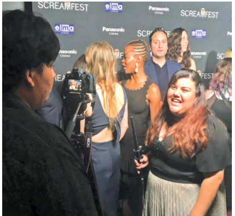
M.I.T. High School’s student-led media team descended on the ‘black carpet’ with Creating Creators at the opening night gala of the Screampfest Film Festival.

Today our Mt. Olive filmmakers are conducting interviews on the red carpet, but tomorrow they may be the ones walking the red carpet.