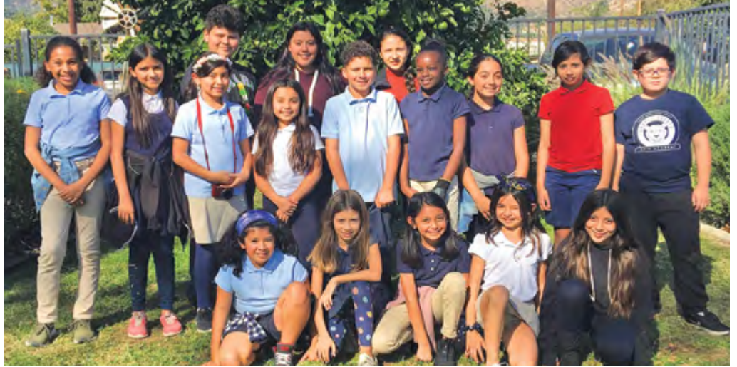
The 2019-2020 members of Student Council and Volunteer Club at the site of the school's growing garden.