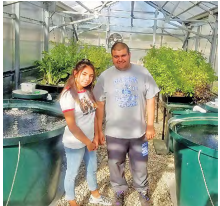
Students in the Adult Transition Class tending to the greenhouse that contains two aquaponics systems with tanks housing fish as well as organic herbs and vegetables used by the Academy of Culinary Entrepreneurship.

In this way, the Academy of Culinary Entrepreneurship is based on a symbiotic relationship similar to that of the greenhouse and aquaponics systems themselves.