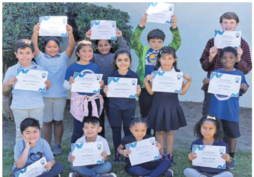
Our Students of the Month for October proudly displaying the certificates they received at the school assembly.

Dollars which go into a drawing for prizes. The assemblies are a wonderful experience for our students and well attended by our supportive parents and families.