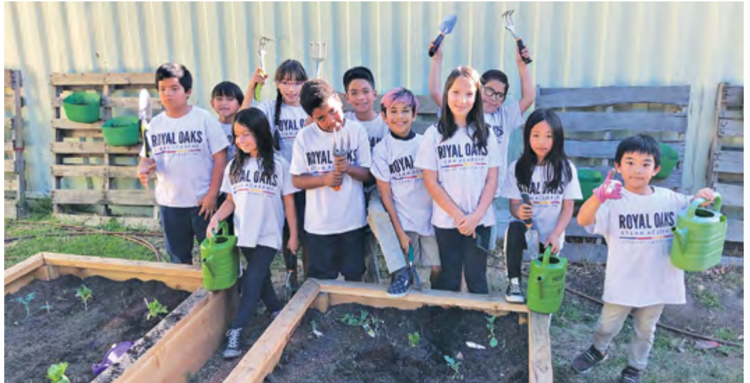
Students clearing the beds in the garden to prepare the soil for planting new herbs and vegetables that will be ready for Spring.

different vegetables and herbs that they grew on their own. A culminating project each year is to have a meal from the largest spring harvest. Depending on the harvest, the meal may include vegetable soup, caprese salad and rosemary rolls. It truly is a labor of love for the students each year.