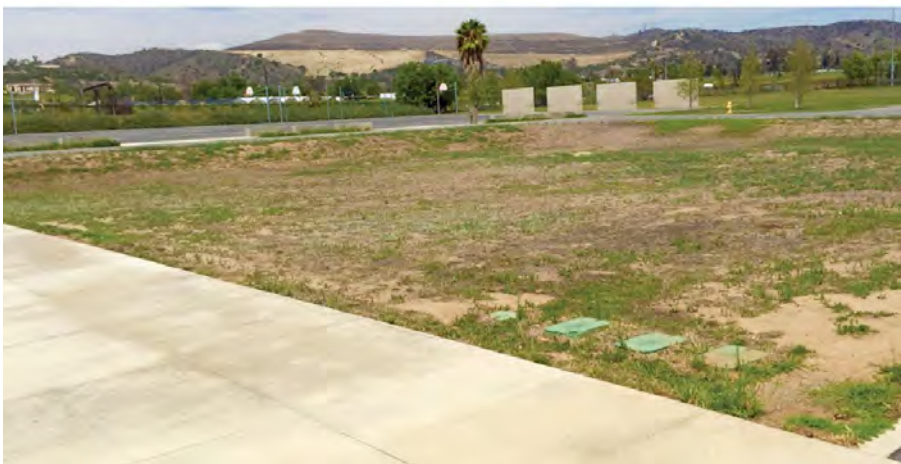
An artist's rendering of the new building and the portion of our school property where the multi-purpose room will be constructed.