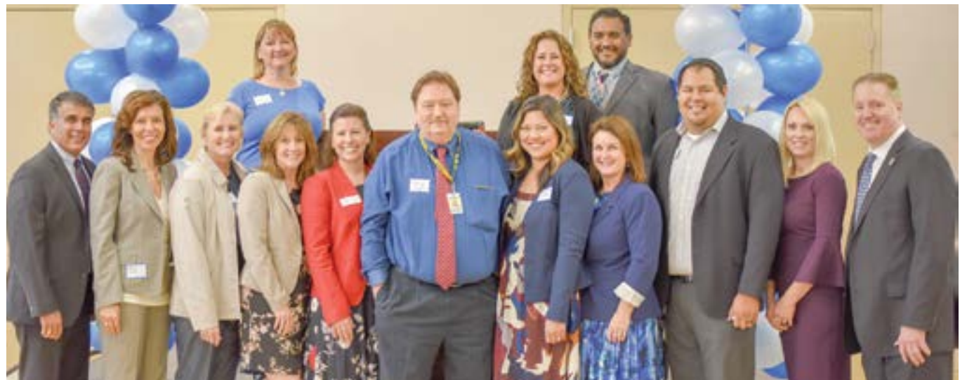
Brea Olinda USD executive cabinet members and principals gather for a photo at the 2nd Annual State of the Schools Breakfast.

Video highlights from the event can be viewed on the district's Web site at www.bousd.us .