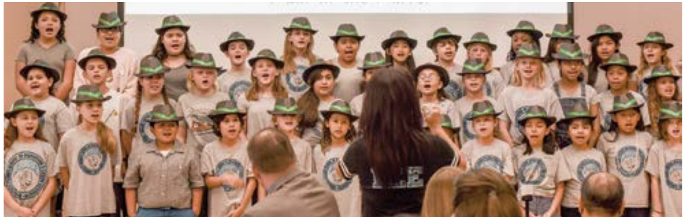
Laurel Elementary Magnet School "Leopards Choir" singing at the 2nd Annual State of the Schools Breakfast