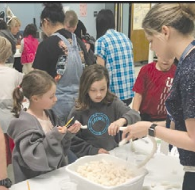
Laurel Family STE(A)M Nights Engage the Community

early learners also participated in the monthly literacy and STE(A)M training called "Bright Futures/Futuros Radiantes."