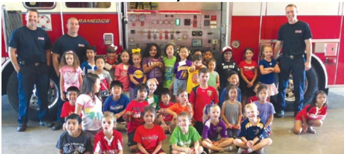
Country Hills students take a tour of the local Brea fire station.