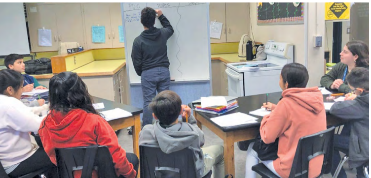
With the help of a college tutor, students use inquiry skills to solve complex problems as a group.

The mission of AVID is to ensure that all students are prepared for a rigorous college experience when they graduate from high school. When your child becomes a part of the AUHSD AVID program, you will have an entire team of people focused on their academic success!