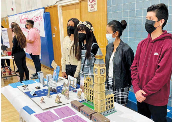
Engage Academy Parent Night-Students are presenting their projects on an essential question.

Through a collaborative approach, Engage Academy teachers design interactive academic experiences and foster strong relationships with students. A routine grade check-in process offers additional support and delivers individualized feedback to each student and parent. The three teachers plan the lessons and activities together so that students can engage in meaningful problems that are important to them and that are similar to what writers, historians and scientists do in the real world. Through this type of teamwork, the important role of social interaction