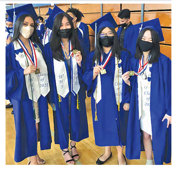
AUHSD scholars earned over 1,303 Seal of Biliteracy Awards in twelve different languages in 2021.

Seal of Biliteracy in twelve different languages and almost 700 junior high school scholars for earning the District Pathways to Biliteracy Award (ribbons) and/or Orange County Department of Education (OCDE) Pathways to Biliteracy Awards (medals/certificates). Thanks to our scholars, staff and families' diligent work, Seal of Biliteracy awards were earned in the following languages: Arabic, American Sign Language, Bengali, Chinese, French, Indonesian, Japanese, Korean, Mandarin, Spanish, Tagalog and Vietnamese. Forty-one students earned triliteracy awards: earning the Seal of Biliteracy in three languages.