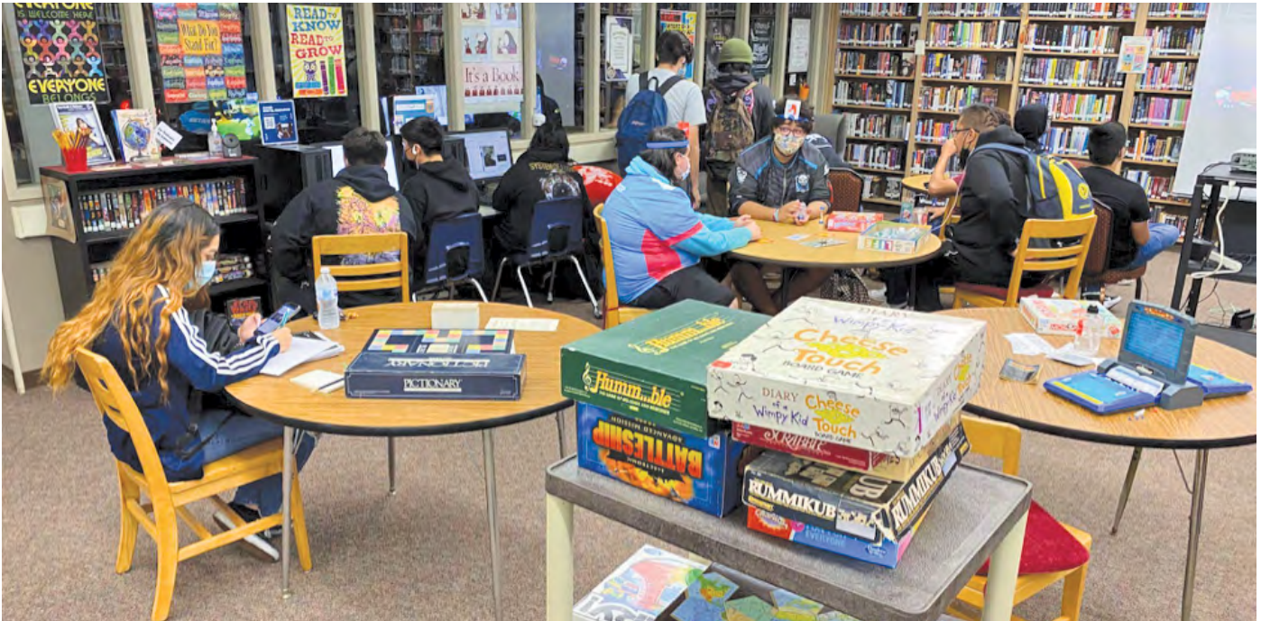
Students playing games at the Gilbert Library, challenging traditional expectations of the role of a school library.

programming collaboration with the eSports Club and College & Career Center. It has become a hub for students on campus. Despite serving a smaller student population, we strive to offer a safe and functional space for students to supplement their learning in the classroom. This includes developing the students' Five C's and cultivating their college and career readiness. Playing games fosters skills like socialization, theory of mind, and systems literacy. Libraries have refused to remain stagnant, adapting to the needs of the communities they represent-and the Gilbert Library is no exception.