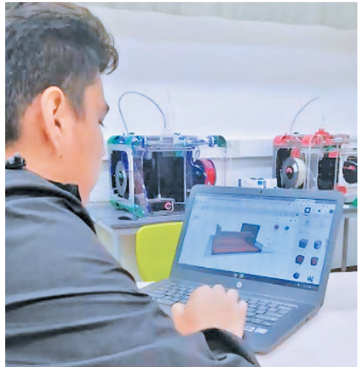
A 10th grade student using Tinkercad to design his prototype to test his product.

With over 70 corporate and nonprofit partners in AUHSD's Educational Pledge and AIME program, this is the perfect collaboration among K–12 education, higher education and the business sector to ensure that students will be employable citizens who are ready to make the world better.