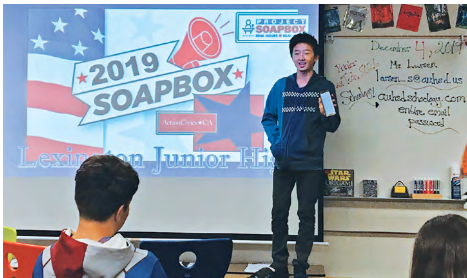
Students in English classes present Soap Box speeches, a public speaking competition facilitated by Mikva Challenge that calls young people to speak out on issues that affect them and their communities.

We are proud to offer not only excellence in academics but also an added emphasis in our Law and Legal Pathway.