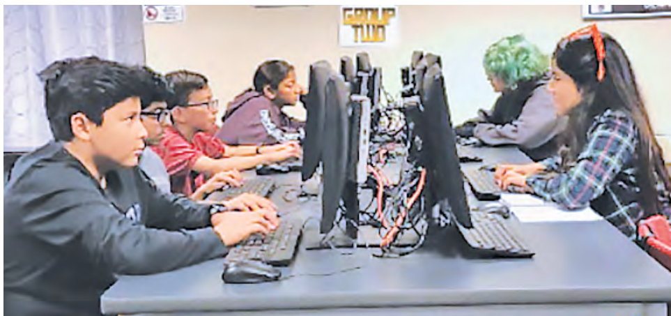
Students are competing in Round 2 of the CyberPatriots competition (Windows & Linux Challenge) in which Middle schools all across the nation compete against each other.

In this pathway, students are learning the valuable 21 st -century skills that employers are looking for.