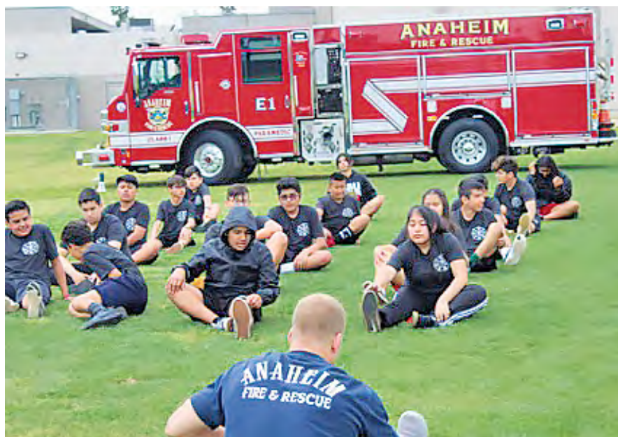
Sycamore's PSA students participate in "Fitness Friday" led by Anaheim Fire and Rescue.

Sycamore's students receive presentations from K9, Forensics, SWAT, Fire and Rescue and even a visit from Anaheim Police helicopter pilots who land on our field.