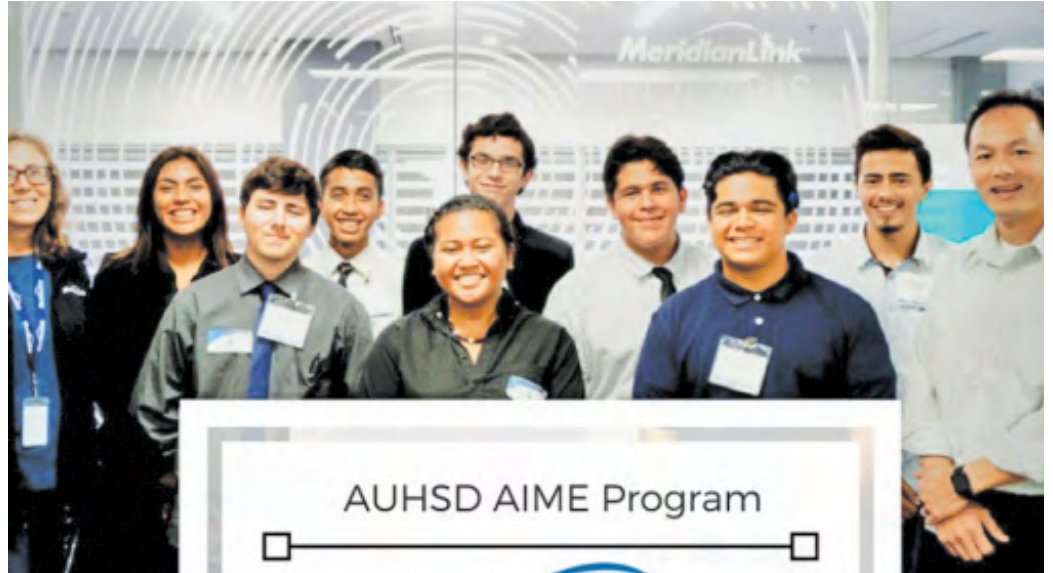
AUHSD students with one of our AIME business partners

partners continues to grow, providing students with the opportunity to apply their learning and skills in work-based settings. Ultimately, the Anaheim Union Educational Pledge, a collaborative, comprehensive partnership with our higher education institutions and the city of Anaheim, is designed to ensure AUHSD students have the support they need to complete their college and career goals.