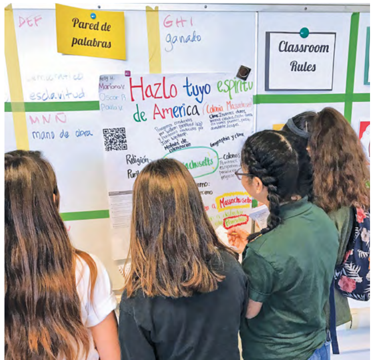
GLLA students collaborating on a brainstorming chart in history class in Spanish.

GLLA is a six-year program that is focused on developing bilingual and biliterate leaders. The program provides students with opportunities to grow through coursework, travel, service learning and work-based experiences. GLLA is one of the many programs that students can begin at Brookhurst and continue at Savanna High School as a pathway. Visit our website for more information.