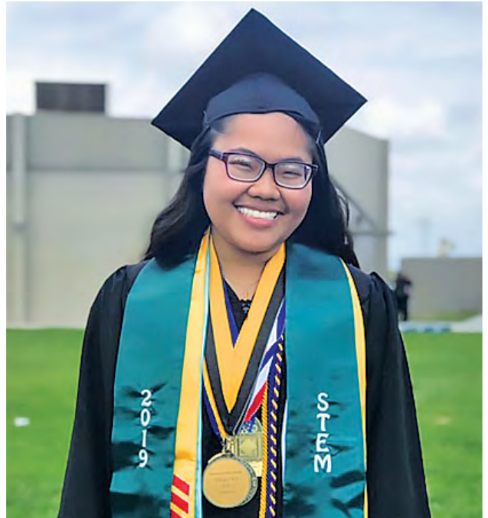
AUHSD had over 1,100 students earn the Seal of Biliteracy in 2019.

Our secondary (seventh- through twelfth-grade) DLI program is the first of its kind in Orange County, and among the first in California. The program serves to ensure that our students are biliterate in mastering grade-level content in two languages. They will also earn the Seal of Biliteracy in the twelfth grade, and be equipped with the skills they need to succeed in an increasingly competitive and diverse global community. The AUHSD DLI is also a 2019 CSBA Golden Bell Award winning program.