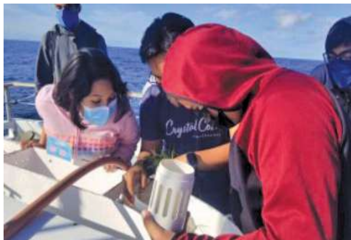
Students Studying Plankton They Caught from the Ocean