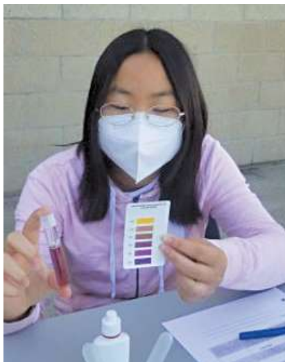
Testing pH in Ocean Water

Some of the most meaningful moments in the class were based upon the excitement that the students felt about being able to take these trips to the actual places they had studied. Many students were inspired by what they had learned on these trips, because the pathway through the field of science in high school and college can be made much clearer through hands-on experience.