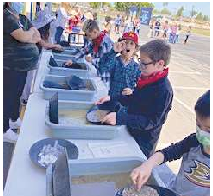
Panning for gold