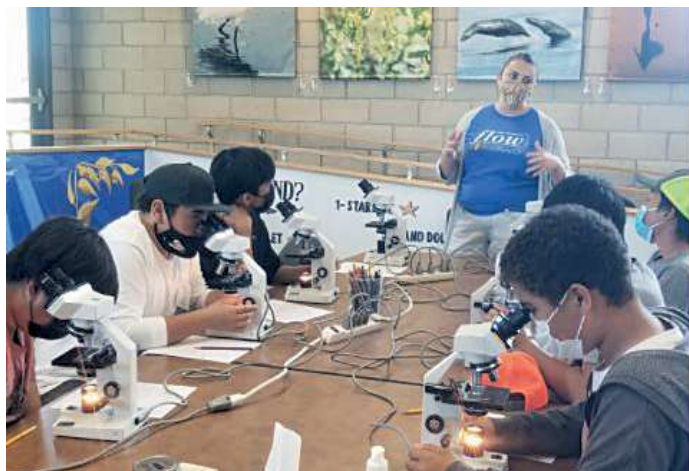
Examining Ocean Life Forms