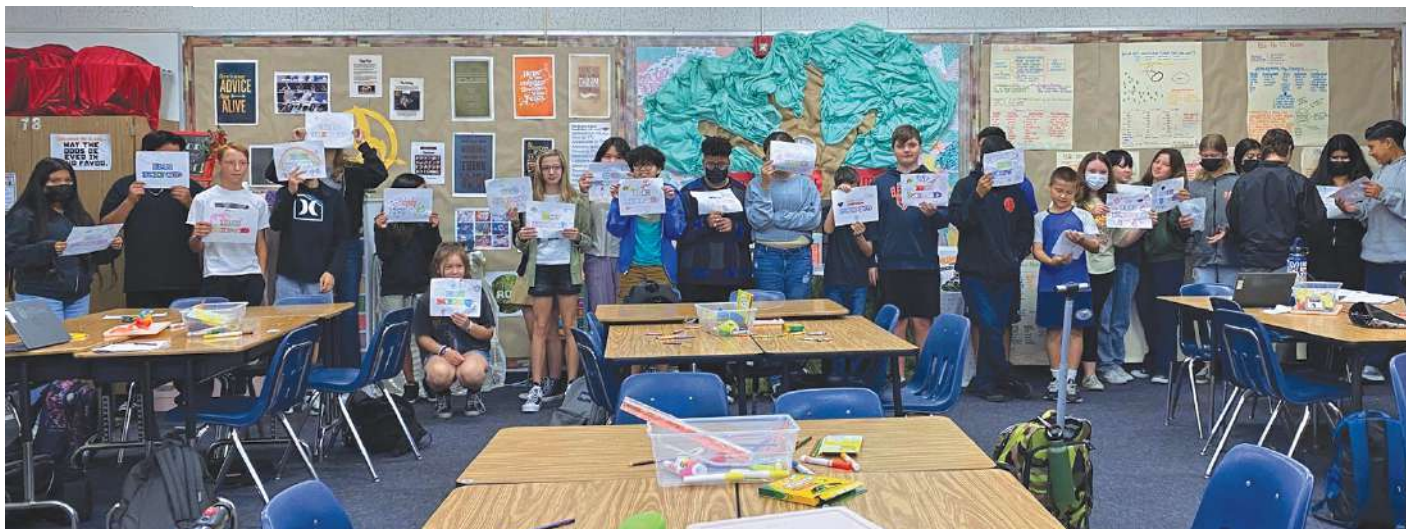
The message “Be kind”

Students LEAD Day lesson was about being kind to each other. Stories of caring for one another as students, as a community was shared. The impact of caring or being kind to each other has on us as humans. Students enjoyed writing “Kind” words and shared with each other.