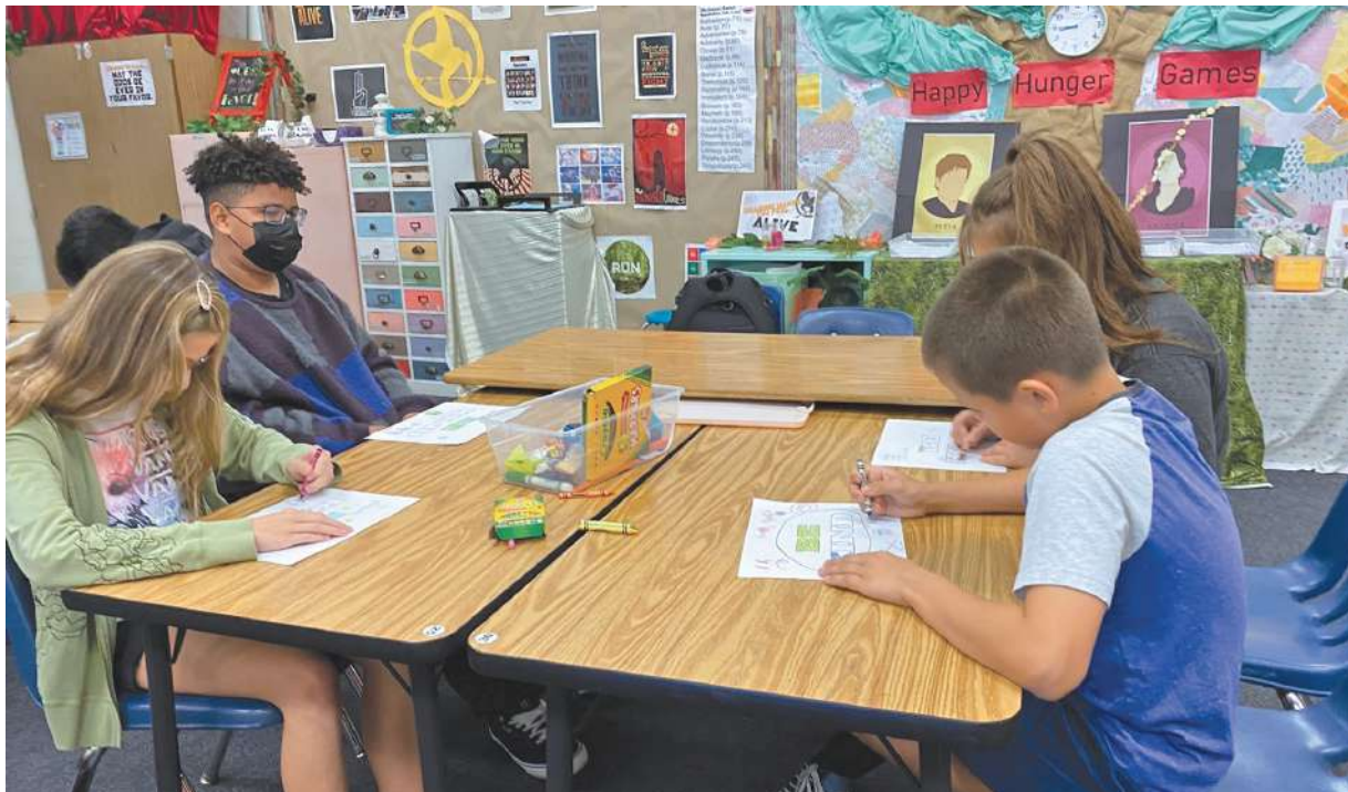
Students working during Spring View's Lead Day

Students LEAD Day lesson was about being kind to each other. Stories of caring for one another as students, as a community was shared. The impact of caring or being kind to each other has on us as humans. Students enjoyed writing “Kind” words and shared with each other.