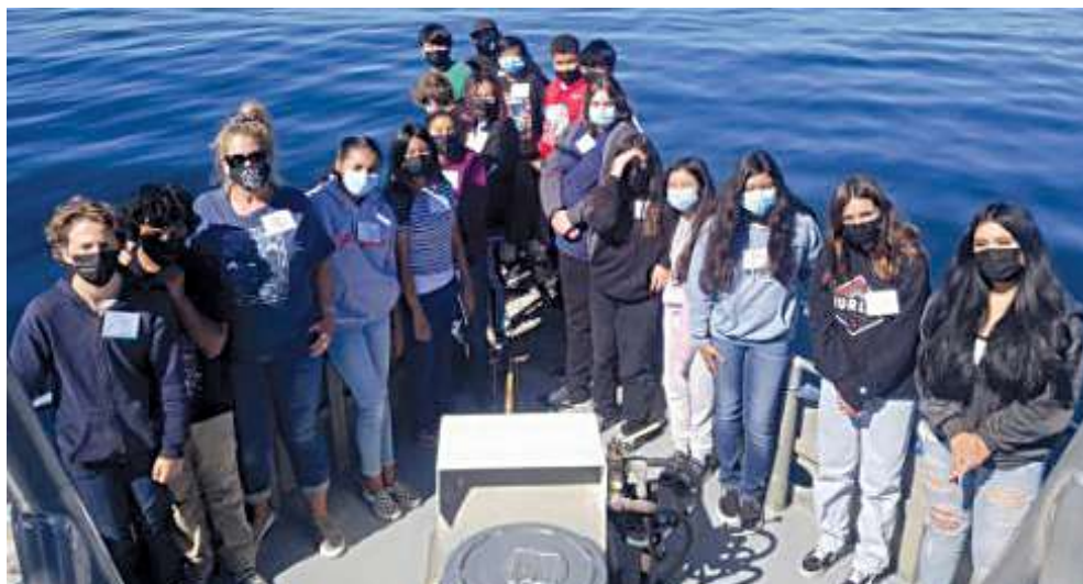
Boat Ride to Examine Ocean Life