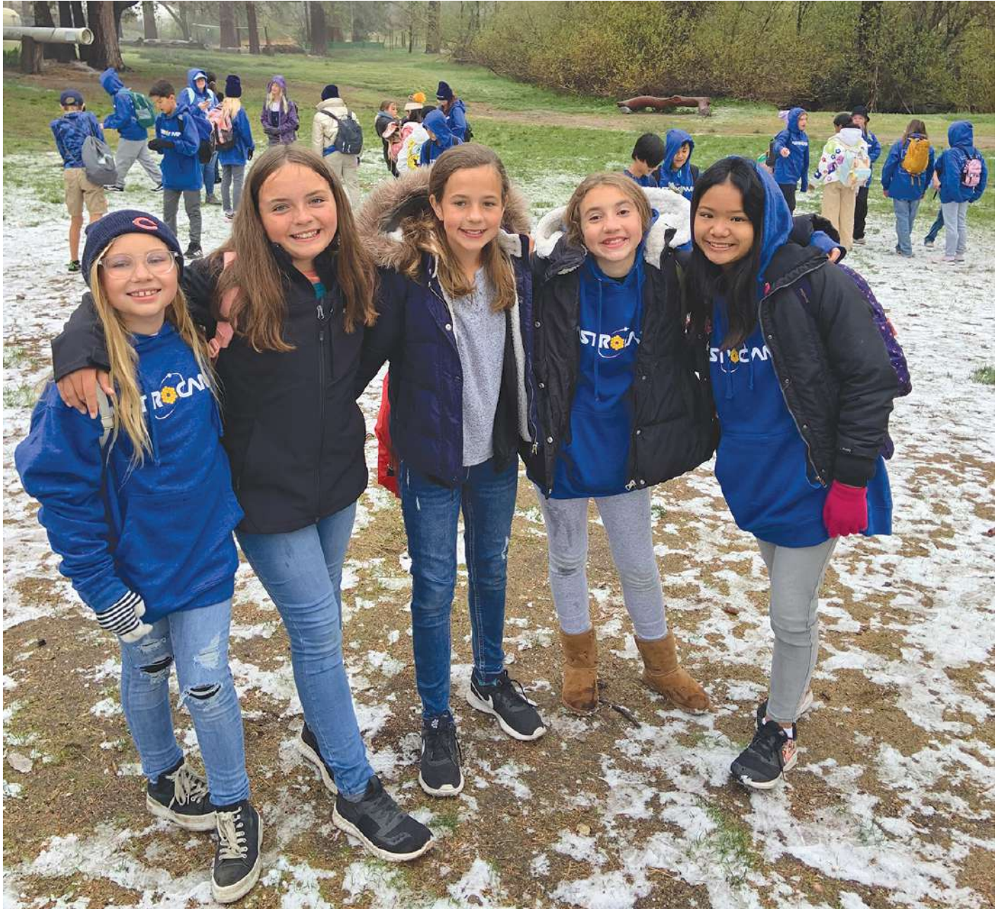
Students in the snow at AstroCamp.

fosters their sense of wonder. Students learned about atmosphere and gases, lights and lasers, electricity and magnetism, and more. There were also STEM activities, hikes, a sky coaster, and so much fun. Our 5th grade teachers organize and prepare our 5th graders for this fantastic experience, and we are so grateful to our AstroCamp Parent Committee for all their fundraising efforts. It takes a big team to bring our students to AstroCamp and we are so happy to be able to return this year!