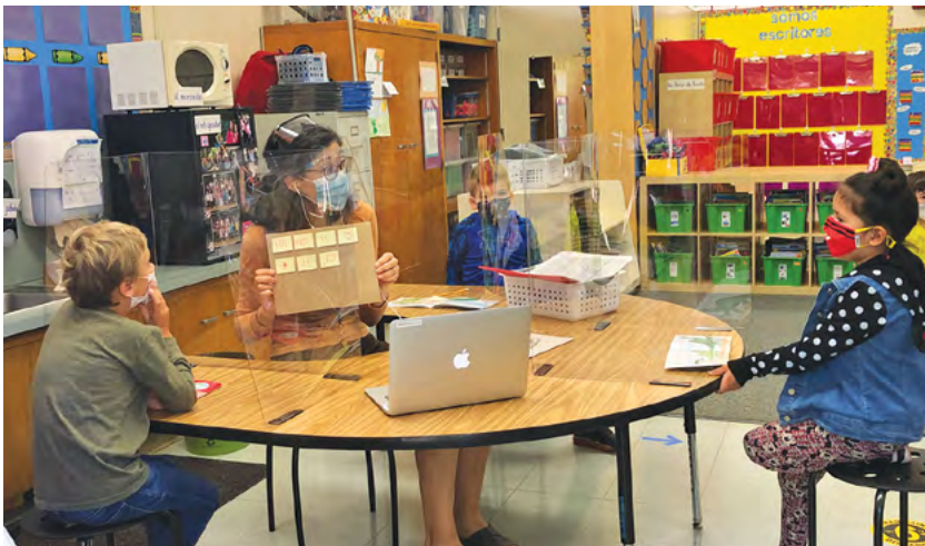
New Classroom Settings