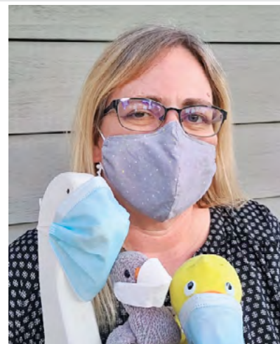
Getting Ready for School

This week, we had children returning in-person to campus in our Learning Centers. On the first day, I heard one of the sweetest sounds ever: children's laughter from the playground. I could see the children from my office window riding tricycles, wearing masks, and laughing together. Learning through play is a great way to learn!