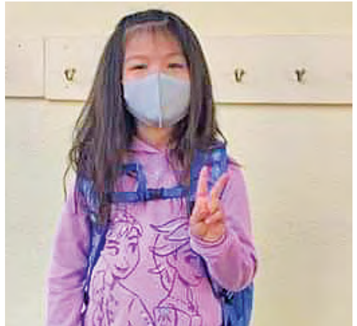
Escondido Kinder student excited for her first day back at school!

I'd like to share with you some of my priorities for our school. My primary goal is to ensure that all children are safe, happy, ready, and engaged to learn and have the best possible educational experiences while at Escondido Elementary. I follow a collaborative and team-building approach and believe that differentiated, rigorous, and developmentally appropriate and relevant instruction is key to achieving this goal. I base every decision I make on what is best for students. In the spirit of building a strong school team, I look forward to working with staff, parents, and students throughout the year to identify areas for improvement in student social-emotional well-being and academic achievement, school climate, and communication.