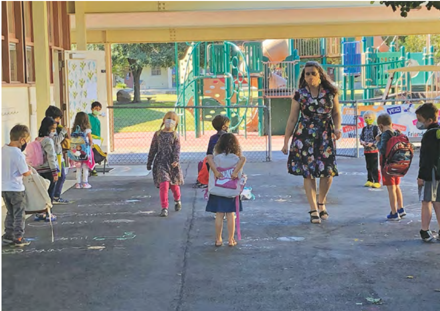
School Days Begin