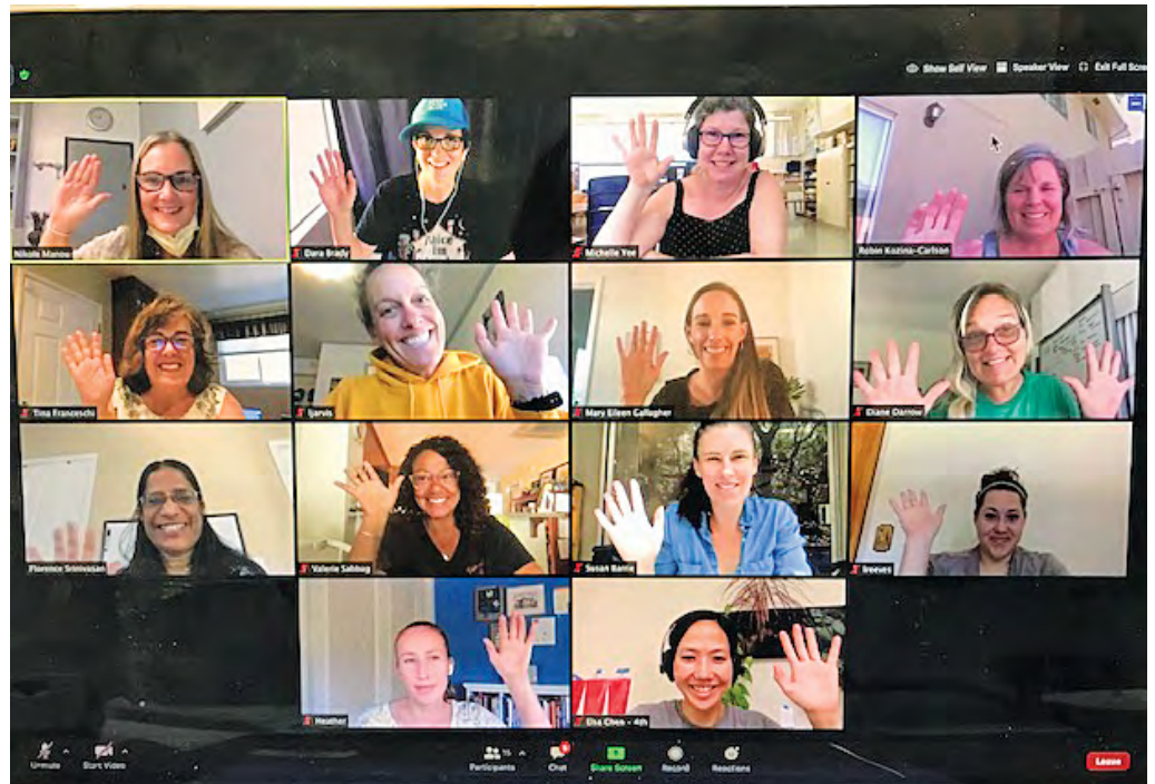
The Full-Year Distance Learning Staff

This year, I am eager to get to know the children and very excited to work with each teacher in this new online program. The FDL teachers are veteran PAUSD teachers who volunteered to participate in this new program. They come from Barron Park, Nixon, Fairmeadow, Hoover, Escondido, Briones, and Ohlone. Our primary emphasis will be to support all students academically and social-emotionally throughout the year given this new paradigm.