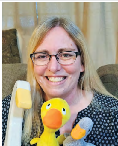
Our Greendell Goslings

Despite the differences, I have been so heartened by our school community. Our teachers, staff, and families have all worked together to make distance learning a fun, engaging experience for our youngest students. Each time I visit our classroom meetings, I see the progress the children are making and the relationships that are developing, even in an online environment.