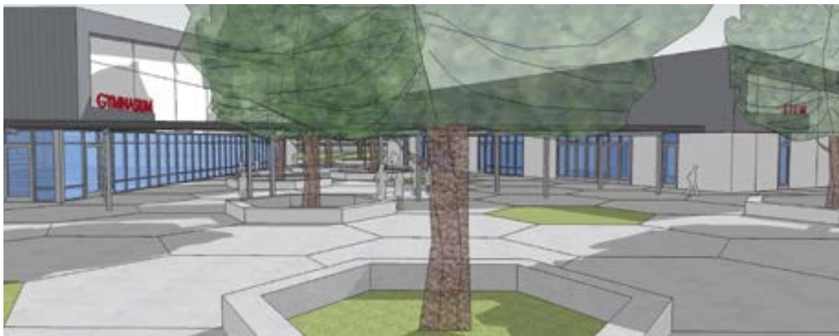
Architect Rendering of Sowers Middle School STEM Lab and Gym/Multi Purpose Room.

We are very excited to be opening a 21st century learning environment at every school site for the 2017-18 school year. These rooms will be equipped with the latest technology to provide personalized learning for every student, increase engagement for students, and allow for greater depth and complexity as students explore new concepts. Perry Elementary School will also be our first school to have a state-of-the-art classroom for science, technology, engineering, arts and mathematics (STEAM). Students at the school will have the opportunity to utilize this room on a regular basis with specialized instruction to bring our science curriculum to life. With all of these changes, HBCSD will be holding parent-engagement nights at each school to showcase our new technology and classrooms and allow parents and community to provide feedback.