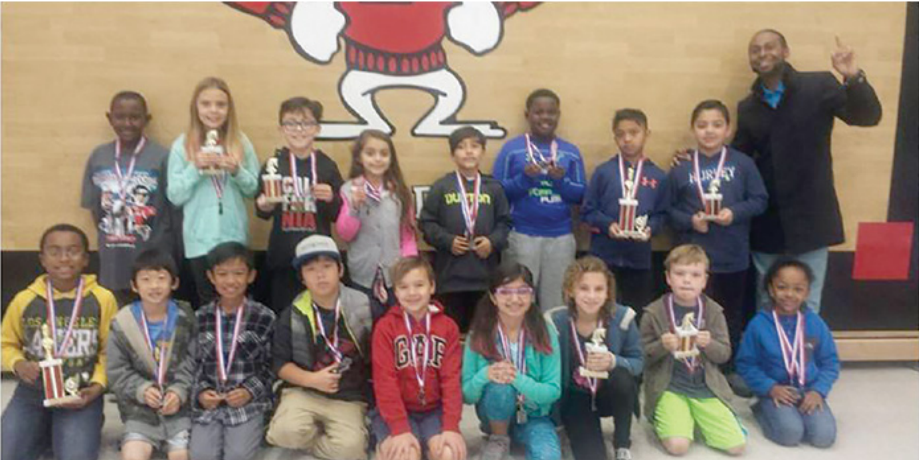
Building Community Relationships