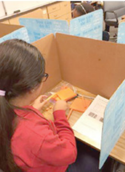
Using CGI Strategies to Solve a Problem