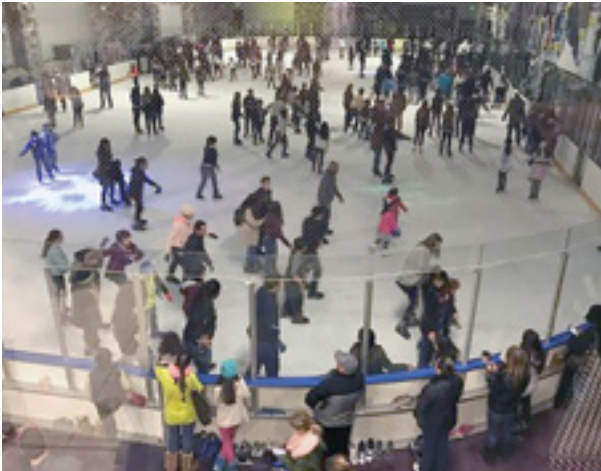
Having a great time at the Anza Ice-Skating Night.

At Anza, we are very proud to create and maintain high expectations for student learning and behavior. We are also extremely happy to be a part of the community and continue our tradition of working closely with all of you. Because of the strong relationship with our community, we have been able to host