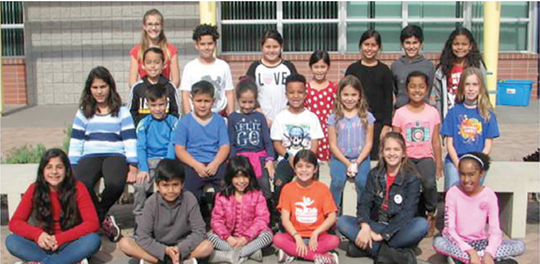
Anza Student Council members meet regularly to help lead school spirit.

The animals provide families with both food and reliable income, and agricultural products such as milk, eggs and honey can be traded or sold at market. When many families gain this new sustainable income, it brings new opportunities for building schools, creating agricultural cooperatives, forming community savings, and funding small businesses. For each animal received, families agree to pass on the offspring of that animal to another person in need. In that act, families become the cycle of positive change.