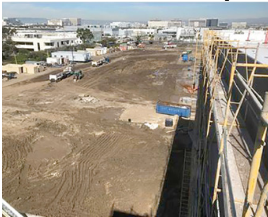
Site Excavation for the Swimming Pool, Gym, and Soccer Fields on the west side of the high school campus