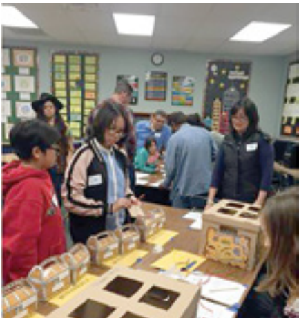
Community Participate in Family GATE Night.

The Cotsen Foundation became partners with Burnett this year. This partnership allows our boys and girls to express how they think mathematically. Cognitively Guided Instruction is changing the way our students view math.